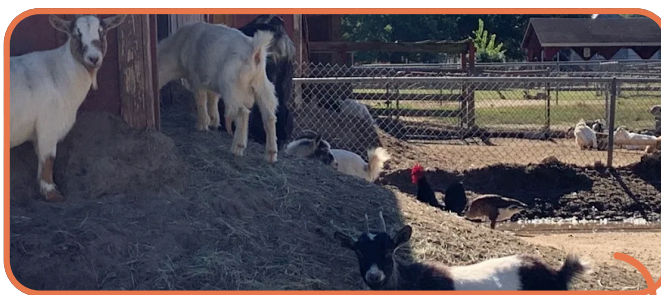
LIVERMAN PARK AND MINI ZOO